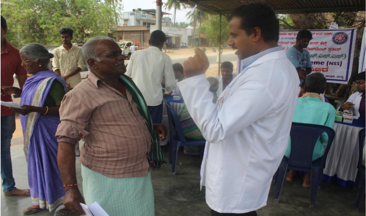
Day 5: Free Dental Camp