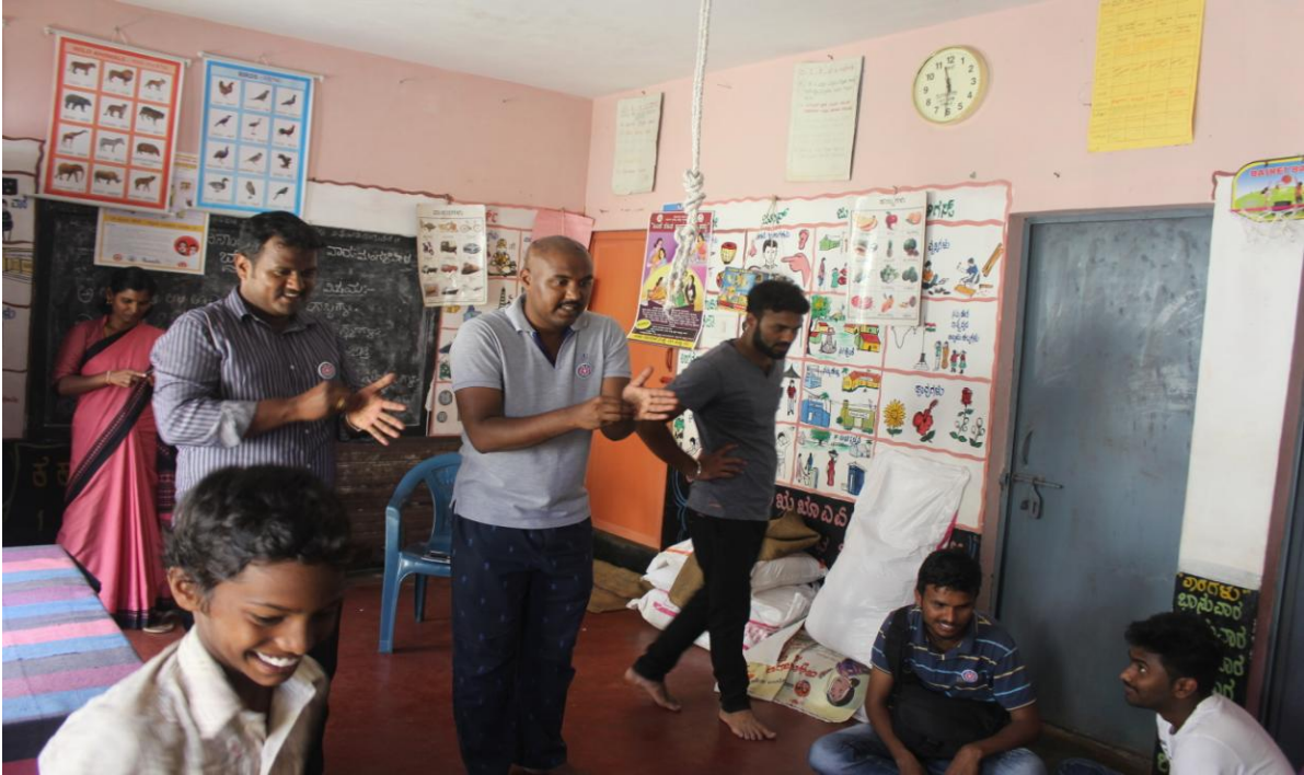
Hand Sanitization Demonstration