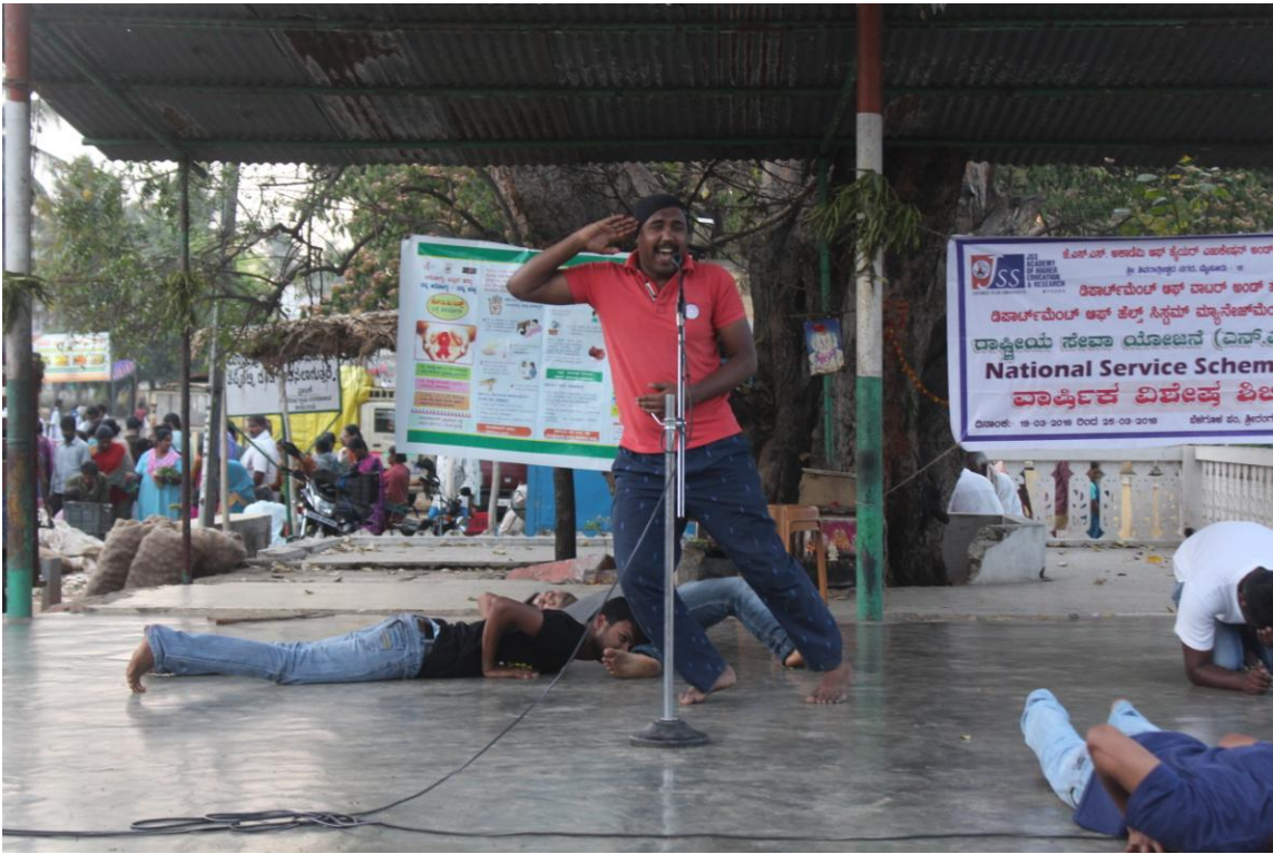
Street Play on patriotism and youth awakening