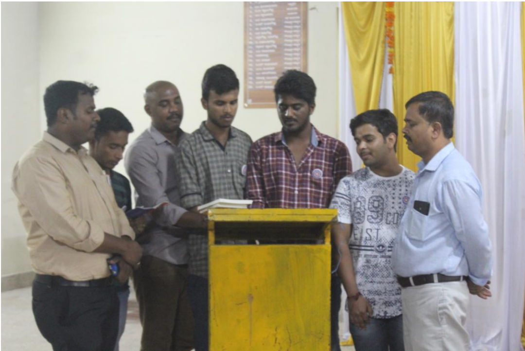
NSS Song being sung in chorus