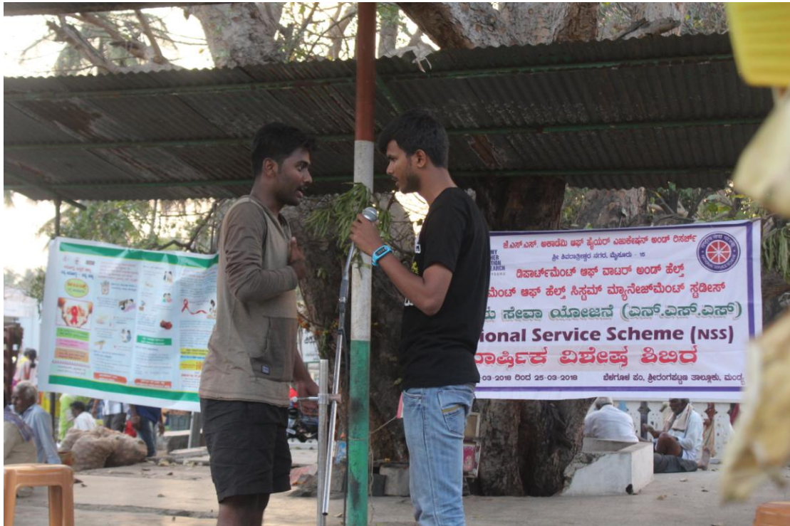
Drama on HIV/AIDS awareness