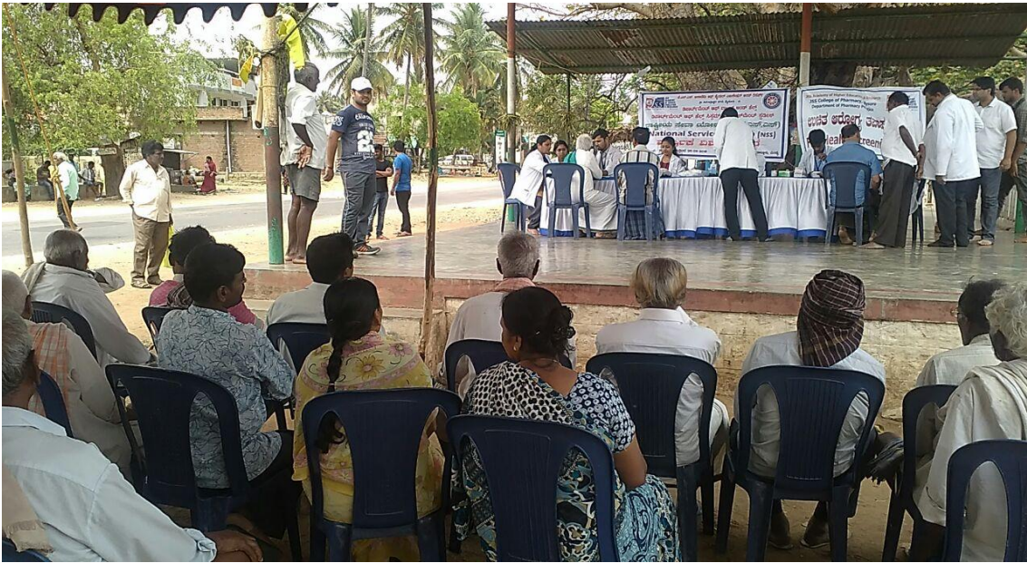
Free Health Screening Camp