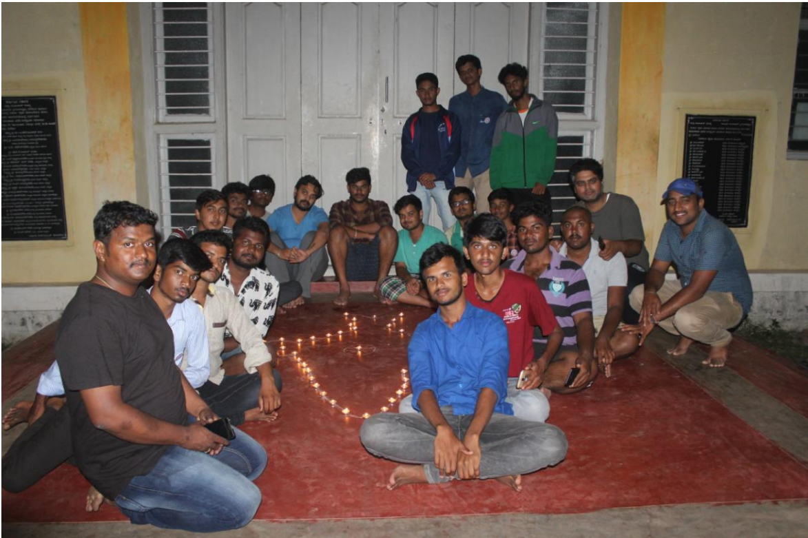
Day 7: Valedictory Function