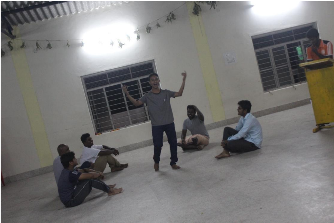
Day 3: HIV/AIDS Awareness Rally