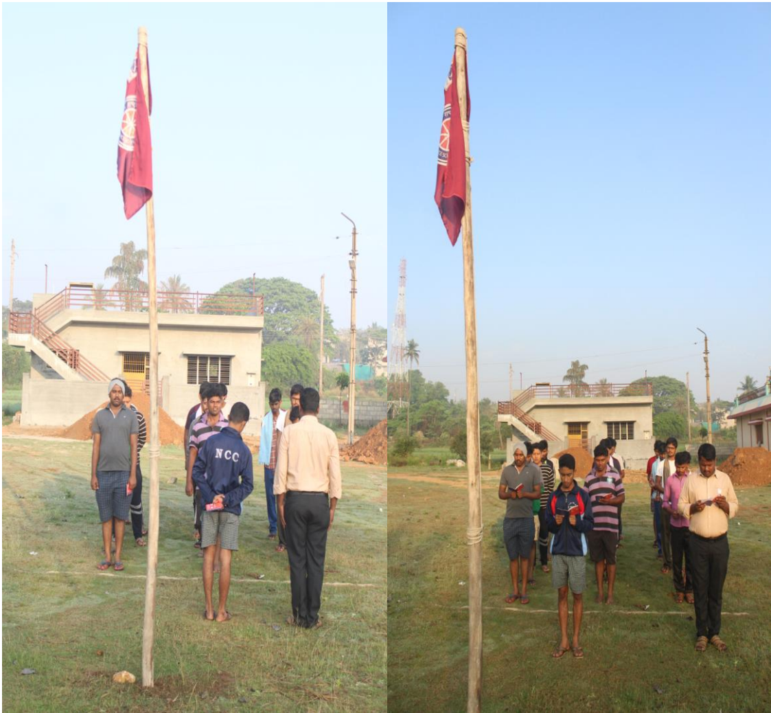
Flag hoisting events, NSS Song