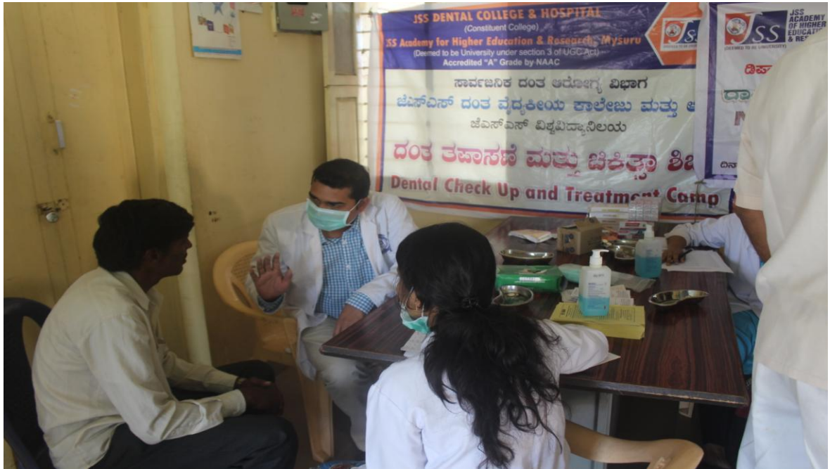
Day 6: Free Medical Camp