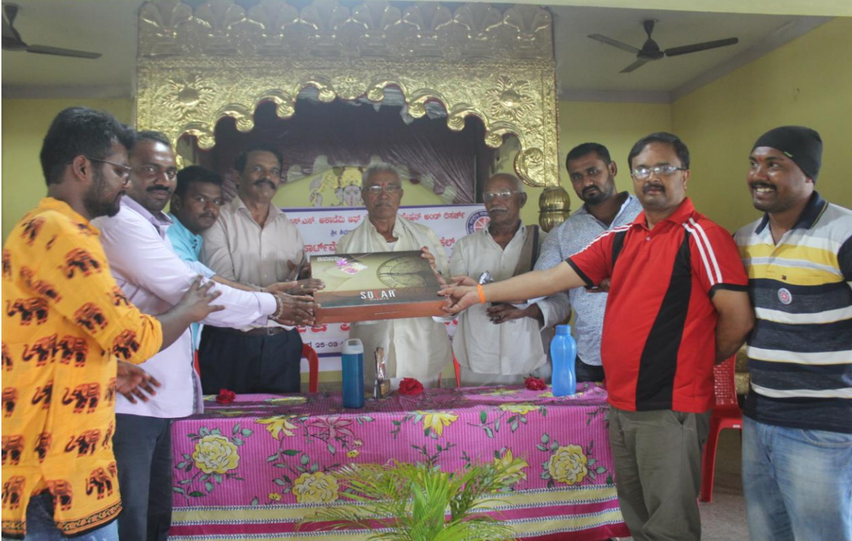
Memento presented as token of remembrance and gratitude