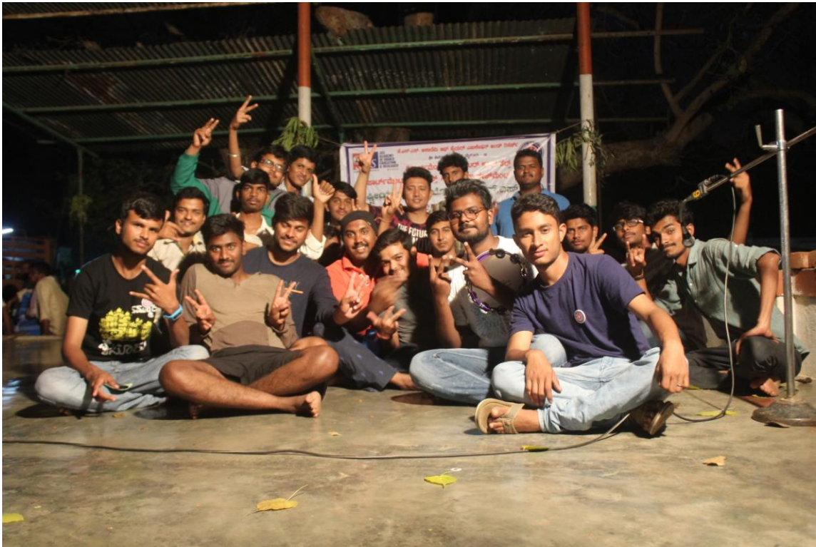
Stage events at santhe (weekly market)