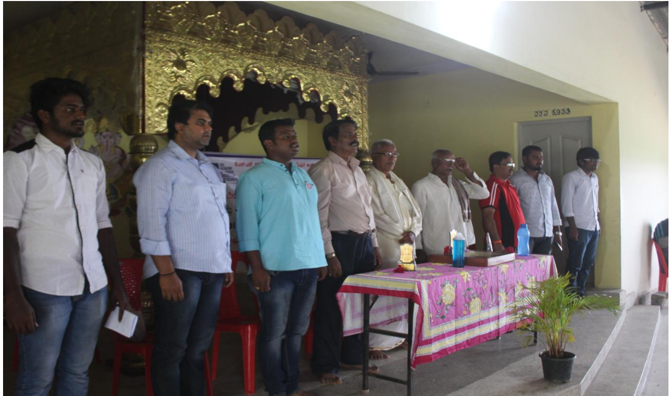
National Anthem at Valedictory